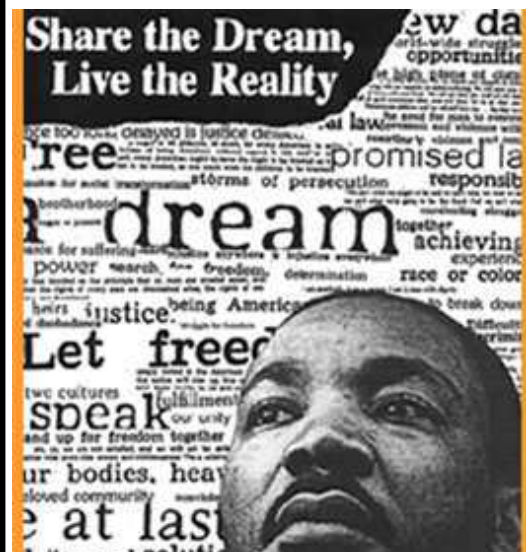
Martin Luther King, Jr. Jan. 15, 1929– April 4, 1968

¡Todo es Gracia para quien está atento y tiene Fe y Amor!